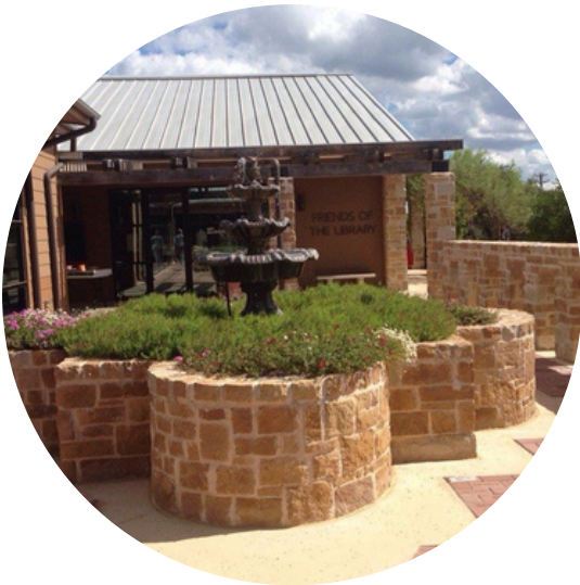
Iye Preston Memorial Library Staff